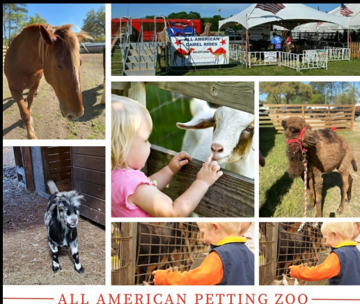
ALL AMERICAN PETTING ZOO

Are you looking for a fun-filled entertainment for the whole family? Look no further! Our upcoming event promises to provide entertainment for all ages with some of the most unique pet animals you don't see on a daily basis. Plus, don't miss the chance to laugh until you can't anymore at the racing pigs! Our event is designed to bring joy and excitement to every member of your family.